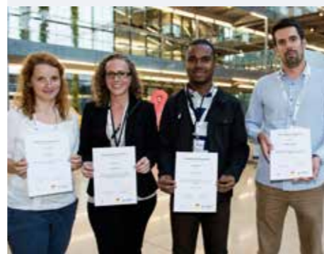
Start SSPH+ Awards for the best PhD publication in public health sciences