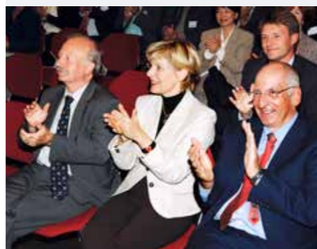
SSPH+ becomes a foundation