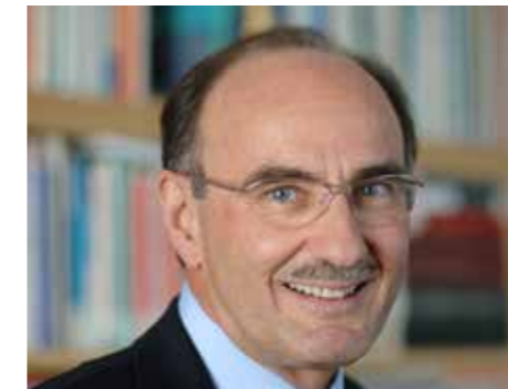
Prof. Felix Gutzwiller, President of the SSPH+ Foundation Board from 2008 to 2012, former Director of the ISPM Zurich (now EBPI), retired since 2013