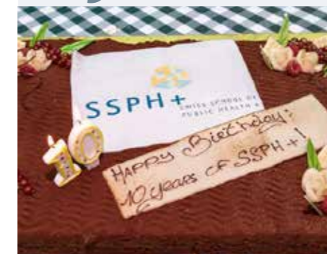
10th anniversary of SSPH+ with eight celebrations at the partner universities